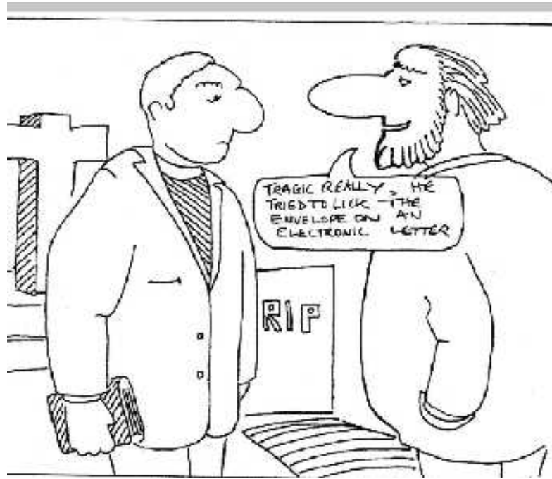
The Risks of Office Automation

However, if as is the case with ETRANS as described in Chapter 2, the MT system fits into an overall document production system (DPS), then text can be created, translated, re-edited and generally prepared for publication within the same electronic environment. In the first part of this chapter we will explore this notion of an electronic document in some detail.