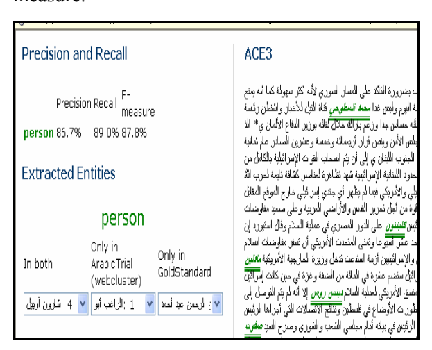
Figure 3: An Extraction from Hurricane Evaluation

Figure 3 is a snapshot of the evaluation performed by hurricane in terms of the above mentioned measure.