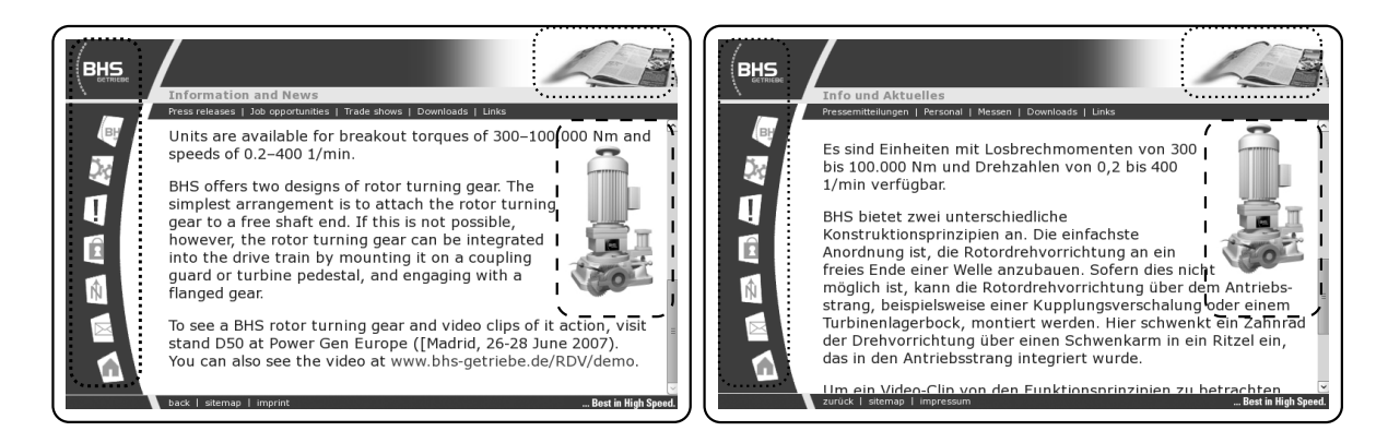
Figure 3: Critical (dashed) and common (dotted) images in a multilingual (EN/DE) site.

pect that low/high frequencies correspond to "critical"/"common" images. We employ a non-parametric approach for estimating the probability density function (Alpaydin, 2010) of the image frequencies using the following formula: