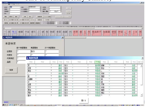
Figure 5 Interface of the manual revision tool (Retrieves a word in the current file)