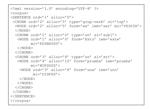
Figure 4: Output of the syntactic analysis for an example sentence Esto es una prueba 'This is a test'.

The module for analysis used in Matxin is currently FreeLing (Carrera et al., 2008). FreeLing combines morphological analysis, part-of-speech tagging, partial-parsing and dependency analysis